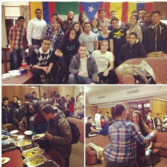
RISA's Spanish/Latin American Theme Night