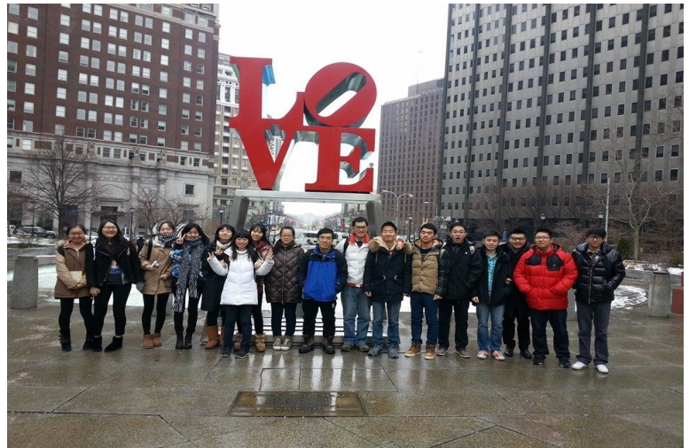
Sanda students enjoy their first visit to Philadelphia.